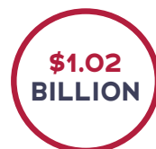
U.S. FUNDING FY1993-FY2022