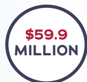
U.S. FUNDING IN FY2022