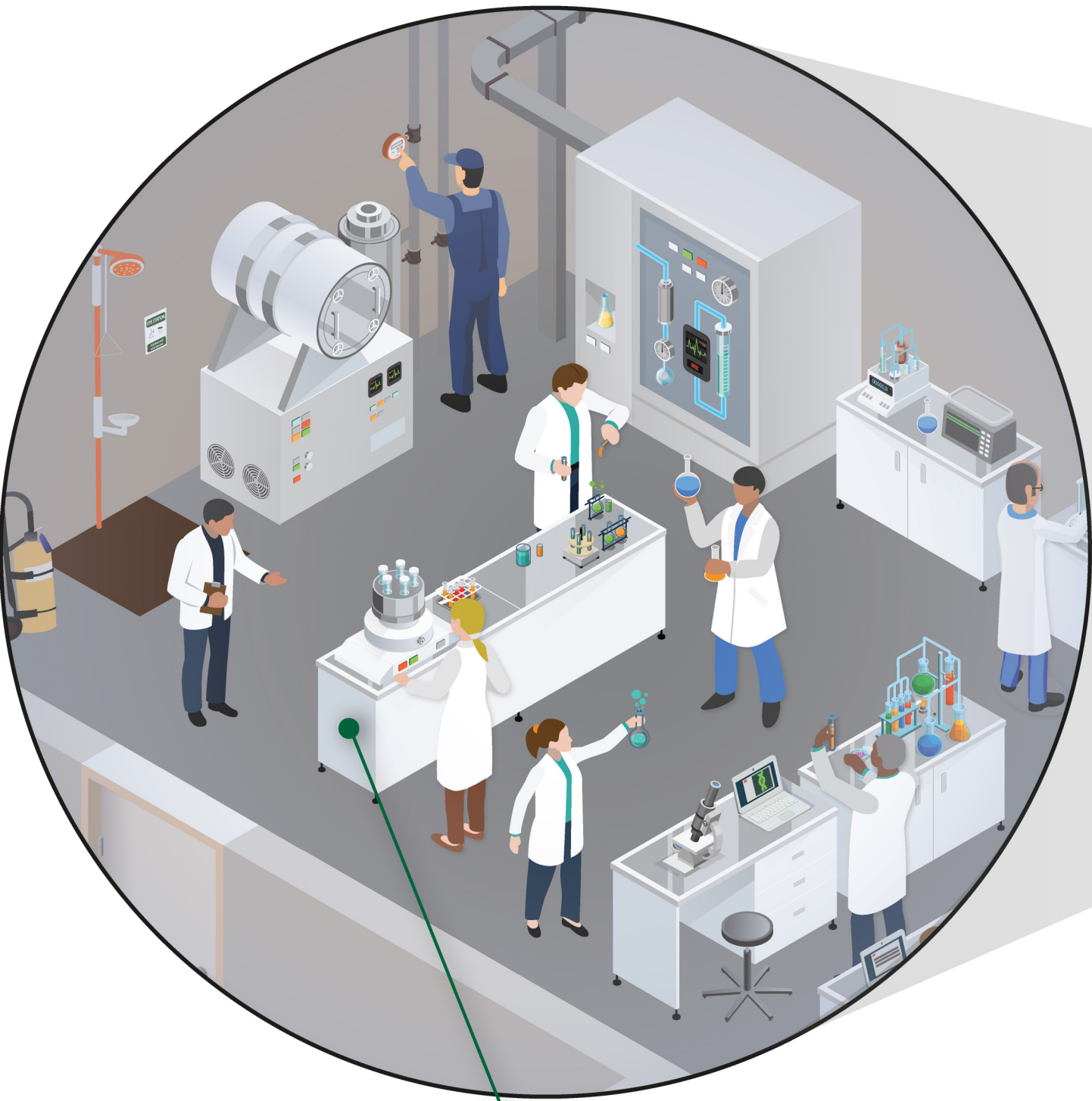
Direct costs - These expenses solely cover research and include lab supplies and equipment; salaries and stipends for researchers and graduate students; and travel costs for conducting and sharing research

The total cost of federally sponsored research includes a combination of both direct and facilities and administrative (F&A) costs. Both types of expenditures are key to an institution's ability to conduct cutting-edge research. F&A consists of the construction and maintenance costs of laboratories and high-tech facilities; energy and utility expenses; and safety, security, and other government-mandated expenses. These costs are real and research cannot be conducted without them.