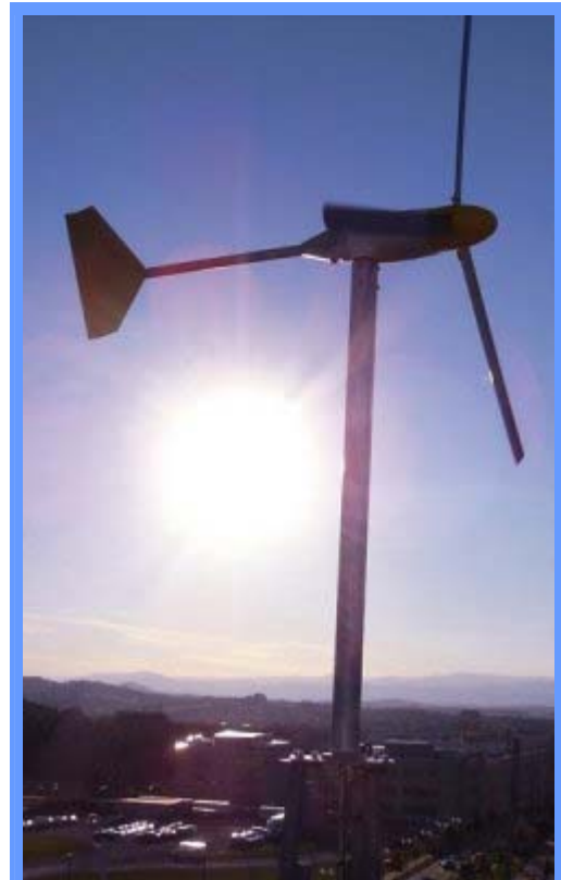
The wind turbine on the East Campus can generate enough electricity, with some help from solar panels, to power a weather station that transmits data back to the ISAT building.

Virginia does, however, have locales with suitable wind speeds for utility-scale wind farms, especially on the mountain ridges along the Virginia/West Virginia border and along the Atlantic coastline and Chesapeake Bay areas, Miles says. It's that potential that led the VWEC, a working group of environmental scientists and other wind-use advocates, to create a computerized map and accompanying landscape classification system to assist in locating potential wind farms for the commonwealth.