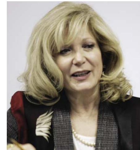
Professors and students from a variety of disciplines participated in the author's 2005 freedom and humanities conference.