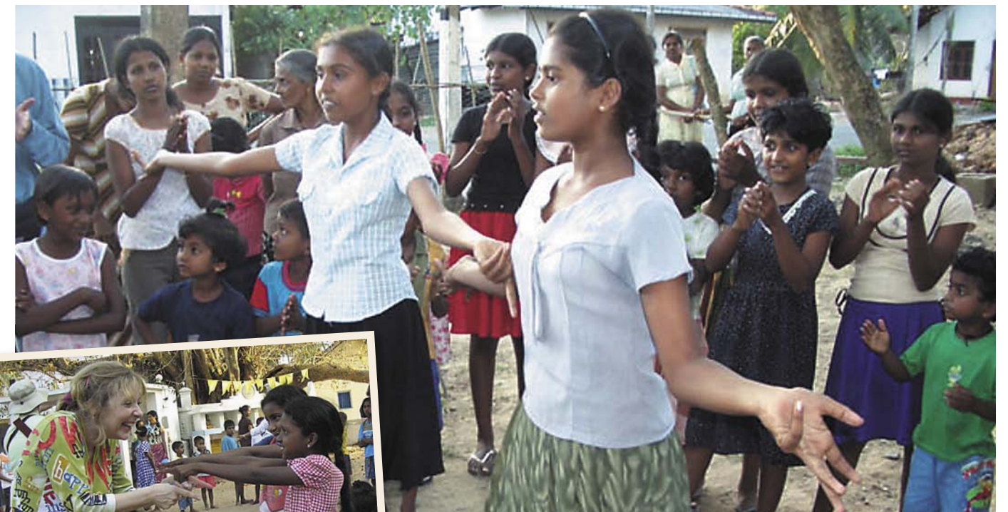
As a welcome to the play therapy team and the author (inset), the teens of Weligama perform a traditional Sri Lankan dance as younger children clap and sing along.

As we step out of the van and walk across the road, a young woman approaches us with a baby on her hip. She greets us with a head shake and smile. Within seconds, 40 children, from 2 to 16 years old, appear. The woman explains that she is the teacher for the children and that the children would like to perform for us. A young girl performs the "bangle" dance, gracefully posturing her small hands and then tapping her wrists together. Of course,