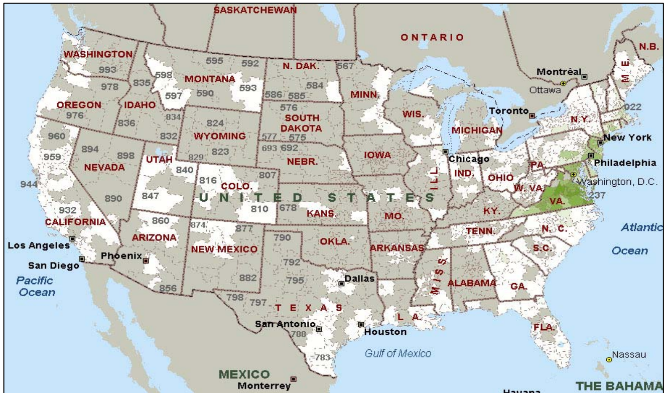
FIGURE 2-6 ON-CAMPUS STUDENTS BY THREE-DIGIT ZIP CODE, FALL 2007