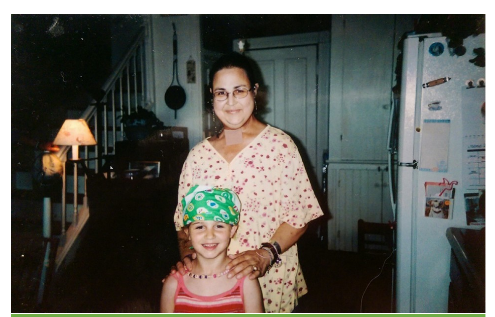
The last photo of my mother and me at my seventh birthday in July, 2005. She wore a wig and covered up her neck.

But an issue arose. I hadn't been at school, so I didn't know how to read and could hardly write. The only way my mother could talk to us was through writing, and she could only get our attention by ringing a cowbell, a noise that I became very used to hearing. She had a device, an electrolarynx, or as I called it, the robot voice maker, but it was too painful for her to use most days. I learned to read lips very well, mostly when she was angry because it was terrifying to see a woman say a million words with just her eyes and lips. I would have rather been yelled at, and I think my dad agrees. But anyways, here's the last photo of my mother and me together at