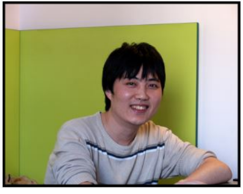
Figure 1. Detail from case scenario program page. Adapted from "Tutor Training Goes Digital," by M. Chandler, 2017 (http://www.jmu.edu/news/uwc/2017/04-news.shtml). Copyright 2017 by Maya Chandler. Used with permission.

in a smaller font for the sake of clarity).