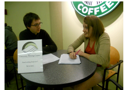
Caffeinated consulting at Carrier Library.

The Write Nights program brings UWC tutors to Carrier Library for late night, walk-in tutoring. The program increases the UWC's availability by 92 percent and offers students a productive alternative to partying.