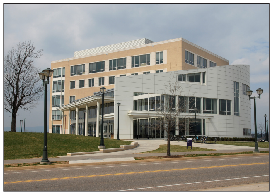
The UWC now offers late-night tutoring in ECL.