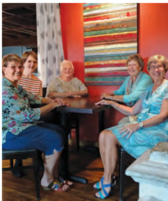
SEA members engage in activities like dinners at local restaurants and events at various venues.

If you are planning your retirement and believe you meet the eligibility requirements outlined in the policy, speak to your supervisor about your accomplishments and ask to be nominated.