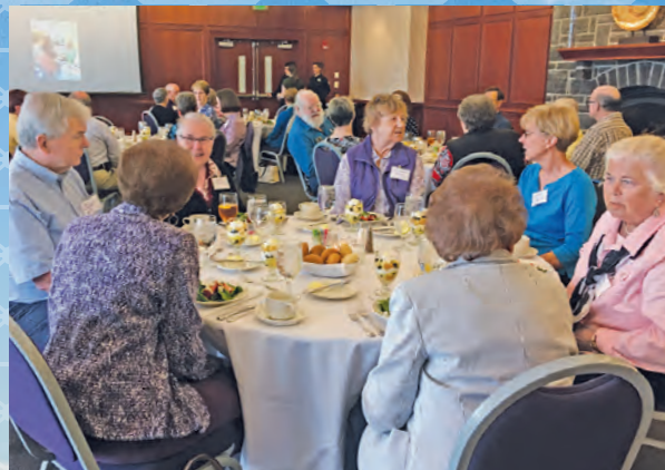
Staff Emeriti Association members enjoy delicious food at a luncheon in the Montpelier Room of JMU's E-Hall.