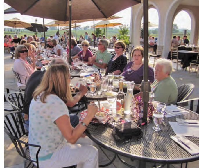
SEA membership offers opportunities for group activities. (Left): Association members tour Hotel Madison and Shenandoah Valley Conference Center. (Above, L-R): SEA members enjoy a softball game at Veterans Memorial Park, play miniature golf at Sandy Bottom Park in Bridgewater, attend a reception at Carrier Library and savor a delicious dinner at CrossKeys Vineyard.