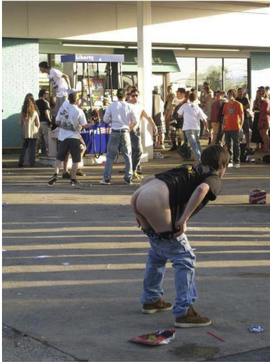
Picture 3. Rioter, Dispersed from Party Site, “Moons”. Police from the Liberty Gas Station. Originally published April 10, 2010 in the online edition of The Breeze . Photographer David Casterline.

ask, “Why did they start doin’ the tear gas?” The first partygoer responds: “People were fighting; people were beating the shit out of each other.” Another partygoer adds that “kids were fighting the police ... [but] if the police didn’t show up they wouldn’t fight ’em.” Then, the first partygoer chimes back in ( italics added ):