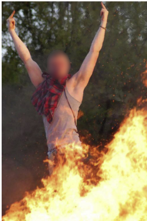
Picture 2. A Rioter in Front of a Dumpster Fire. Originally published in Somers & Sutherland (2012), War Zone , The Breeze . Photographer David Casterline.

The FederalistJMU, (2010b) now talking to people disengaged from the action on the fringe of the Liberty gas station, asks a young man why he thinks the police intervened so forcefully: