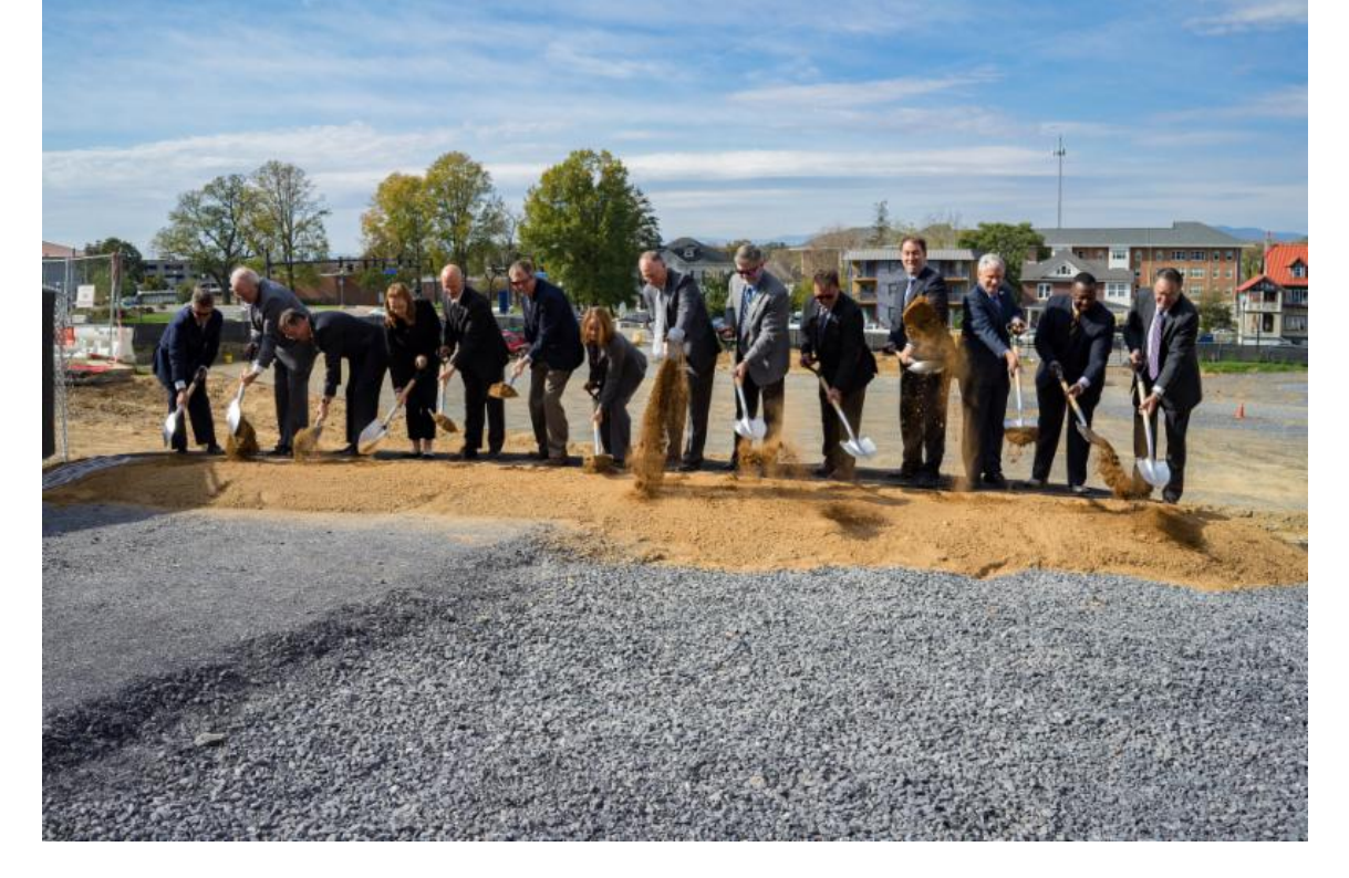
Local business, university, and community leaders break ground for the new Hotel Madison and Shenandoah Valley Conference Center.