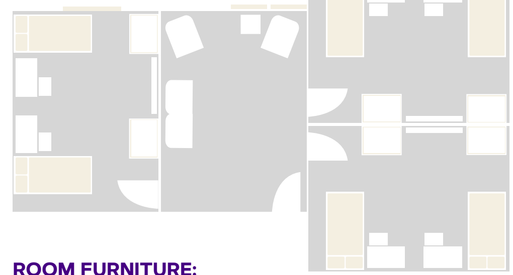
TYPICAL VILLAGE HALL SUITE LAYOUT

ROOM FURNITURE: - BEDS, CHAIRS, DESKS - BUILT-IN CLOSETS AND DRAWERS FIXED