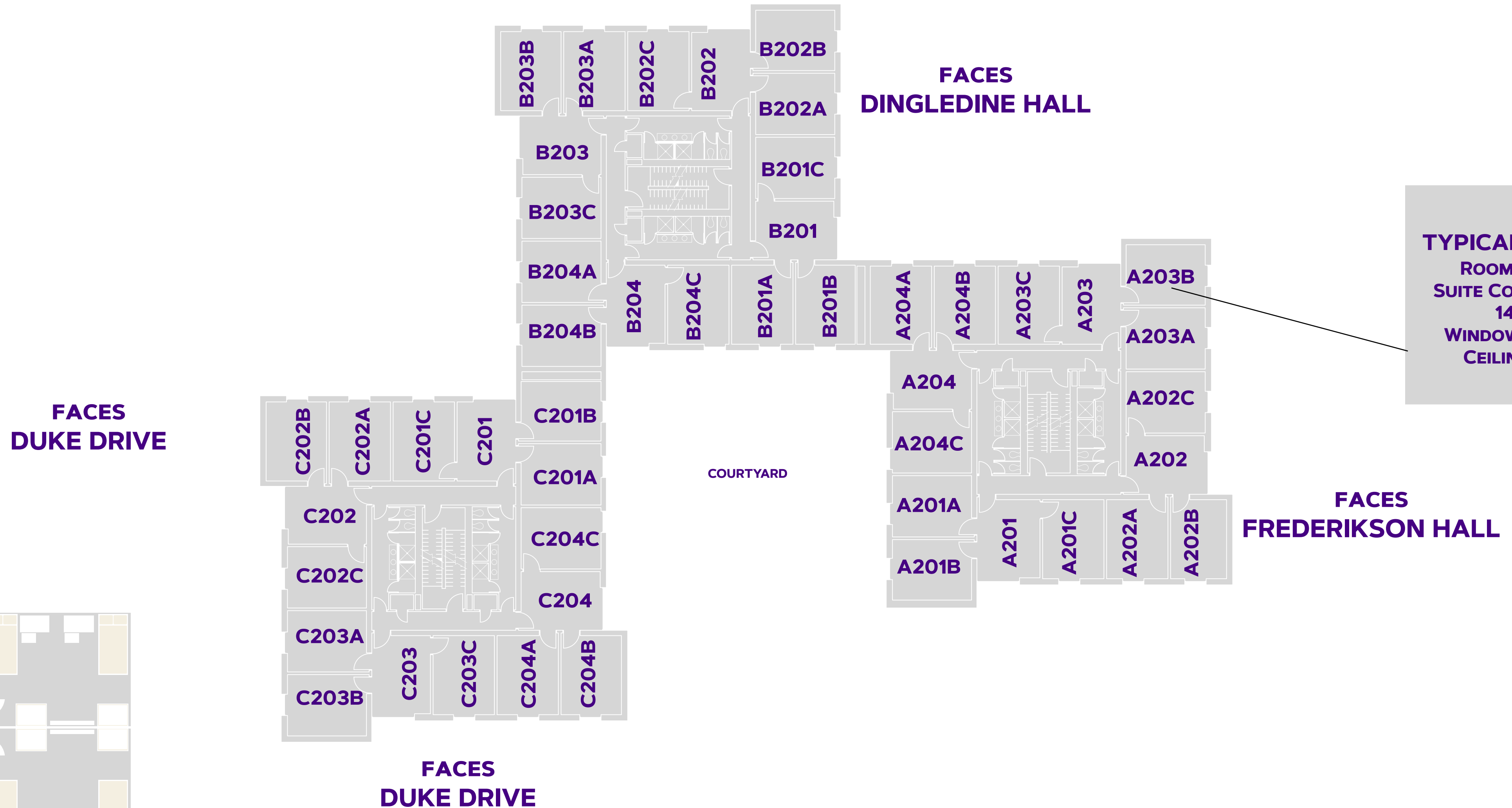
TYPICAL VILLAGE HALL SUITE LAYOUT

#DukesLiveClose #DukesLiveSupported #DukesLIVEON