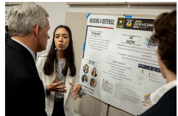
"Hacking for Defense" ENGR 498, POSC 361