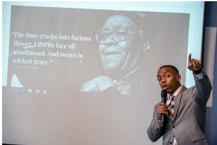
"Innovating the Archives" ENG 302/GRAPH 392/HON 300/WRTC 328