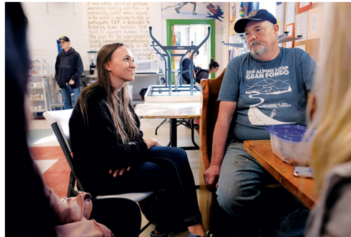
"Community Innovations" IPE 490 (Sec 3)/PPA 483/WRTC 328