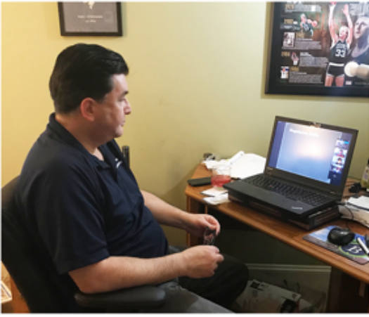
Dad works tirelessly Zoom call after Zoom call to keep in contact with his coworkers.