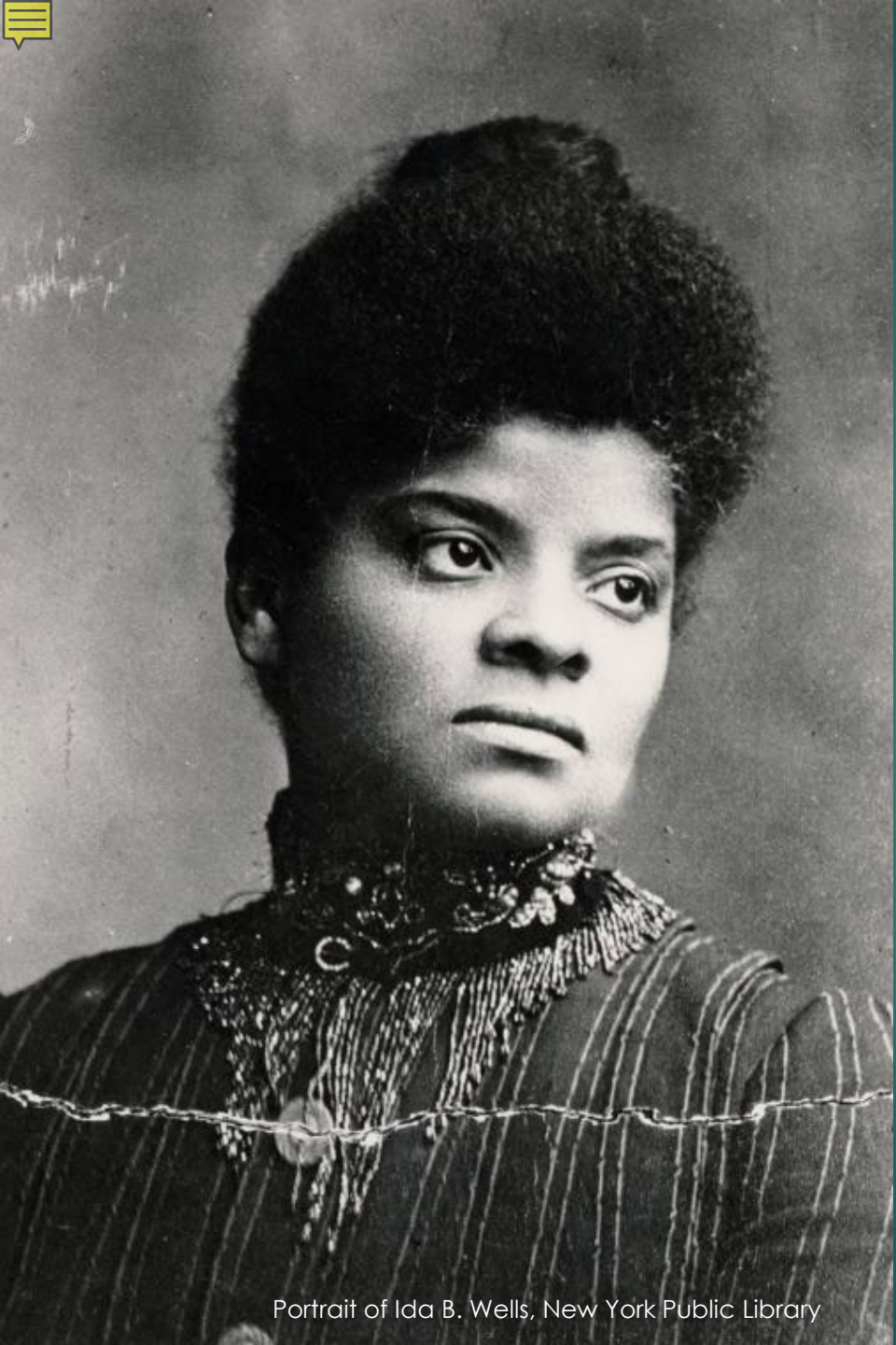
Portrait of Ida B. Wells