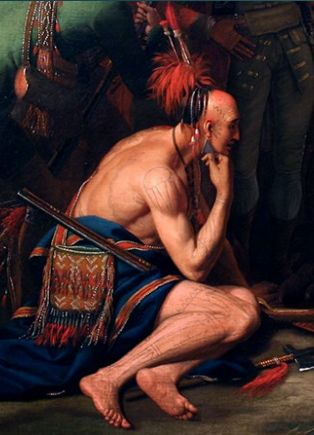
Benjamin West detail from The Death of General Wolfe , 1770