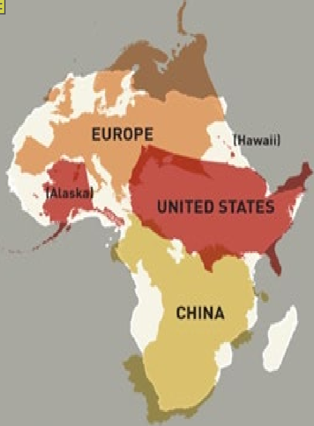
Approximate Area in Square Miles