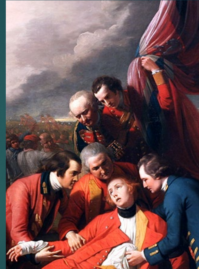
Benjamin West detail from The Death of General Wolfe , 1770

This course explores the dynamics of conflict, warfare, and brutal dispossession that defined the lives of European, African, and North American peoples caught up in the events of these tumultuous decades.