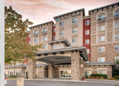
HYATT House Sterling/Dulles Airport 45520 Dulles Plaza, Sterling, VA