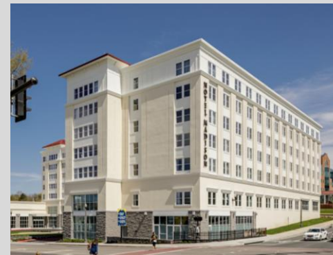
Hotel Madison 710 S. Main St. Harrisonburg, VA