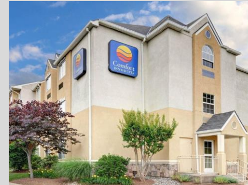
Comfort Inn & Suites Airport Dulles 45515 Dulles Plaza, Sterling, VA