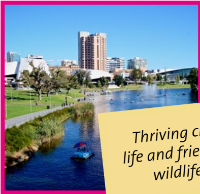
Thriving city life and friendly wildlife