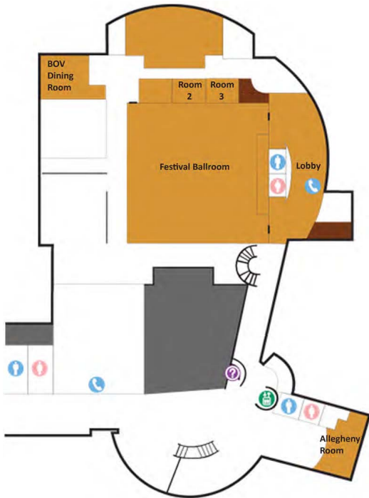
Festival Upper Level