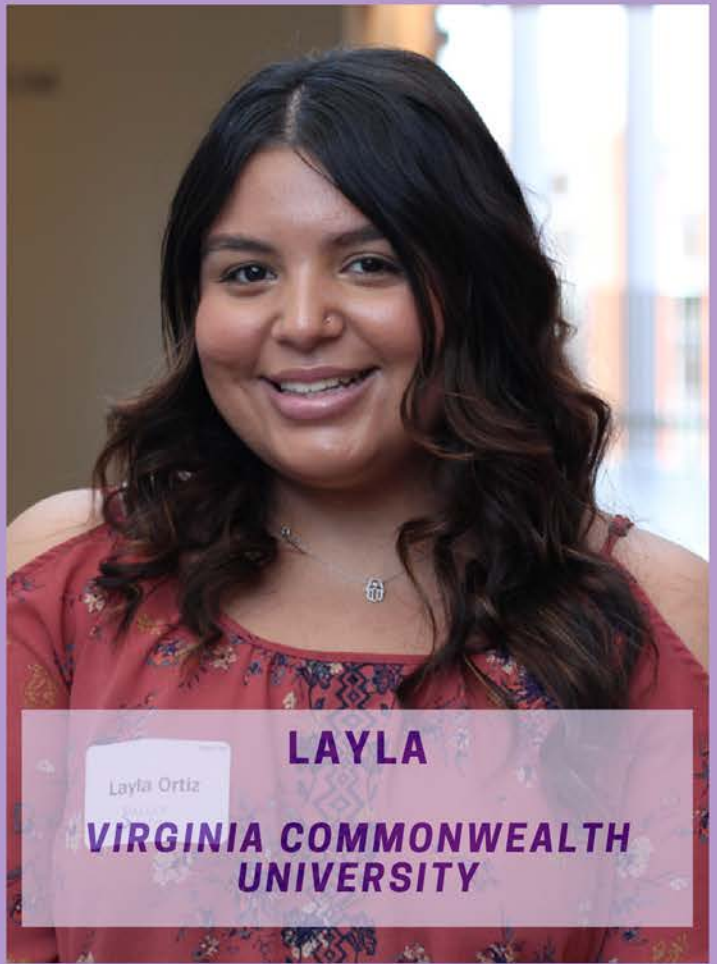
LAYLA VIRGINIA COMMONWEALTH UNIVERSITY