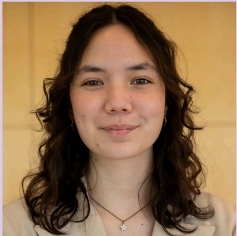
VICTORIA JAMES MADISON UNIVERSITY