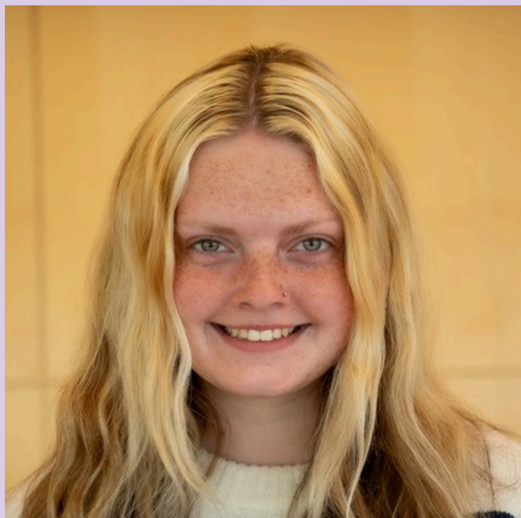
TIFFANY LAUREL RIDGE COMMUNITY COLLEGE