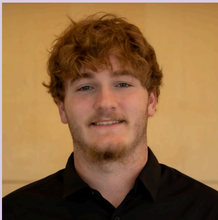
TY JAMES MADISON UNIVERSITY