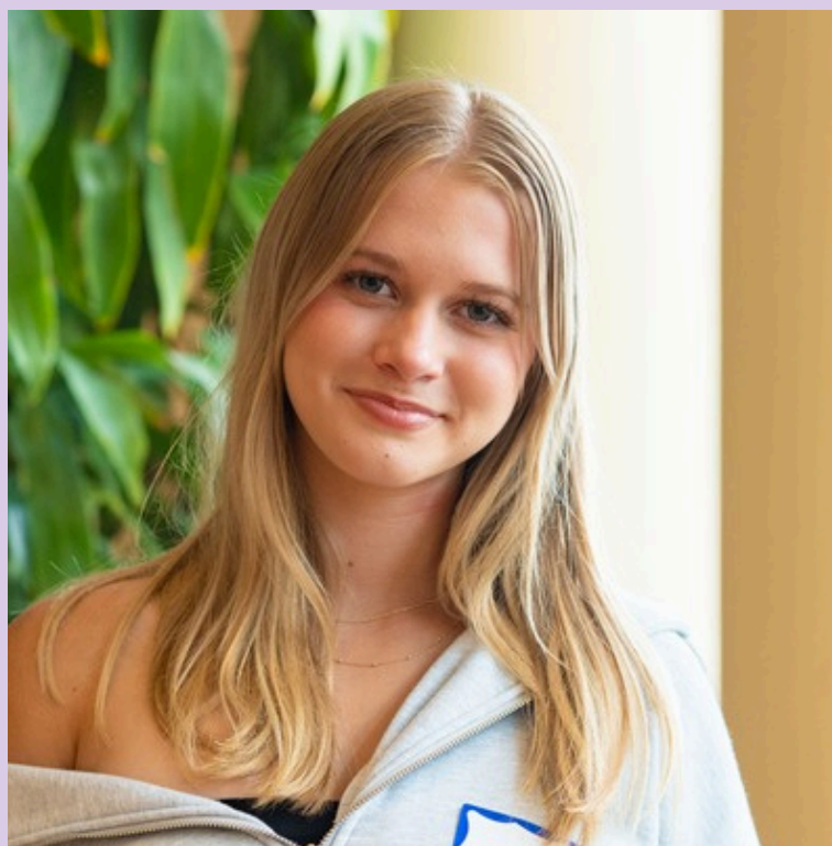
ABIGAIL OLD DOMINION UNIVERSITY