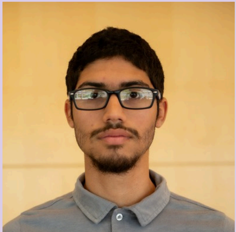
ADAY JAMES MADISON UNIVERSITY