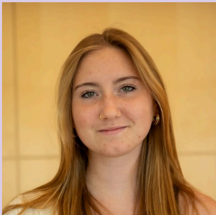
NIA VIRGINIA TECH