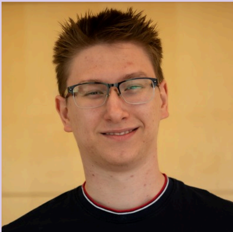
SAMUEL JAMES MADISON UNIVERSITY