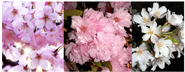
L to R: Yoshino cherry, Kwanzan cherry and Sweet cherry