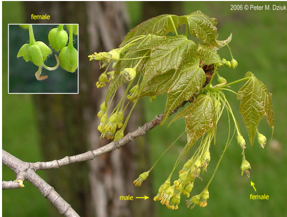
Sugar maple male & female flowers (MN Wildflowers)