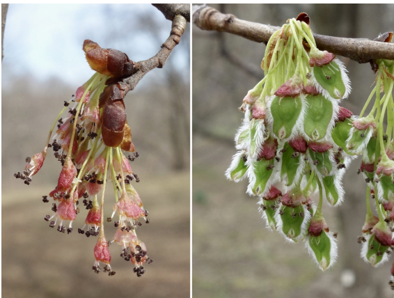
American elm flower and developing fruit (Friedman)