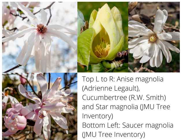
Top L to R: Anise magnolia (Adrienne Legault), Cucumbertree (R.W. Smith) and Star magnolia (JMU Tree Inventory) Bottom Left: Saucer magnolia (JMU Tree Inventory)

Other early spring tree and shrub blooms on campus include: Paperbush, Cornelian cherry dogwood, Korean azalea, Tree Peony, Lily of the Valley, Higan cherry and Callery pear (which is a highly invasive tree).