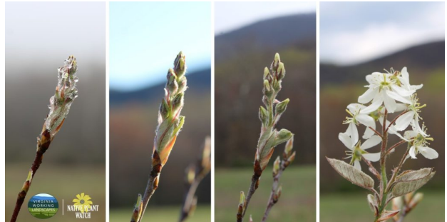
Progression of serviceberry buds to flowers (Virginia Working Landscapes - SCBI)