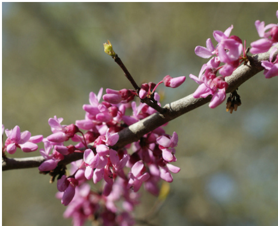
Eastern redbud's pink edible flowers (Ray Mathews)