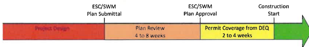
Figure 1. Typical time frame for plan review approval and receipt of permit coverage.

Once the plan and supporting documentation is deemed to be adequate, a plan approval letter will be forwarded to the project engineer. If the project will require a state construction general permit coverage, a SWPPP will need to be developed and a construction general permit registration statement submitted to the DEQ.