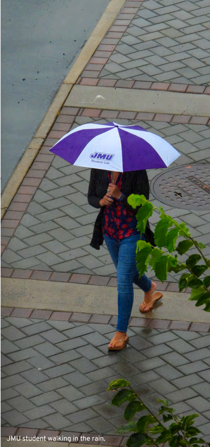
JMU student walking in the rain.