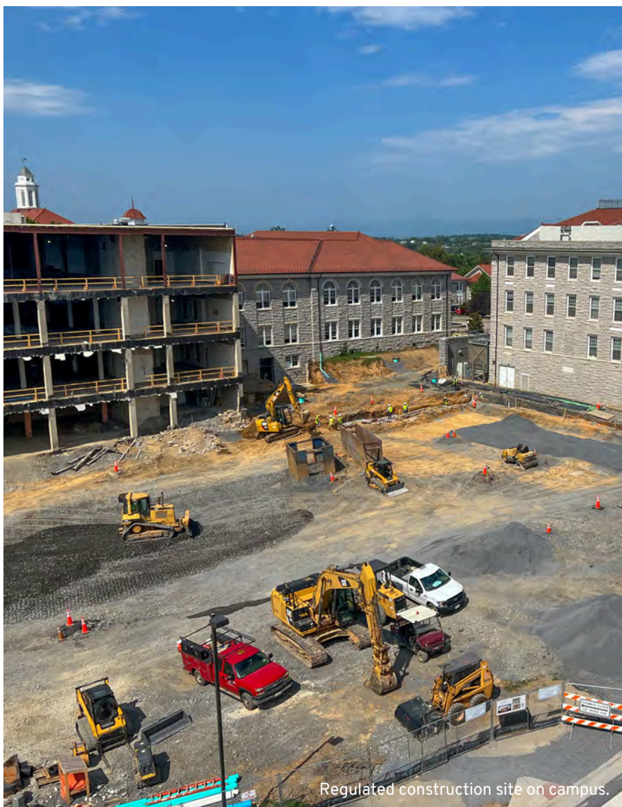
Regulated construction site on campus.