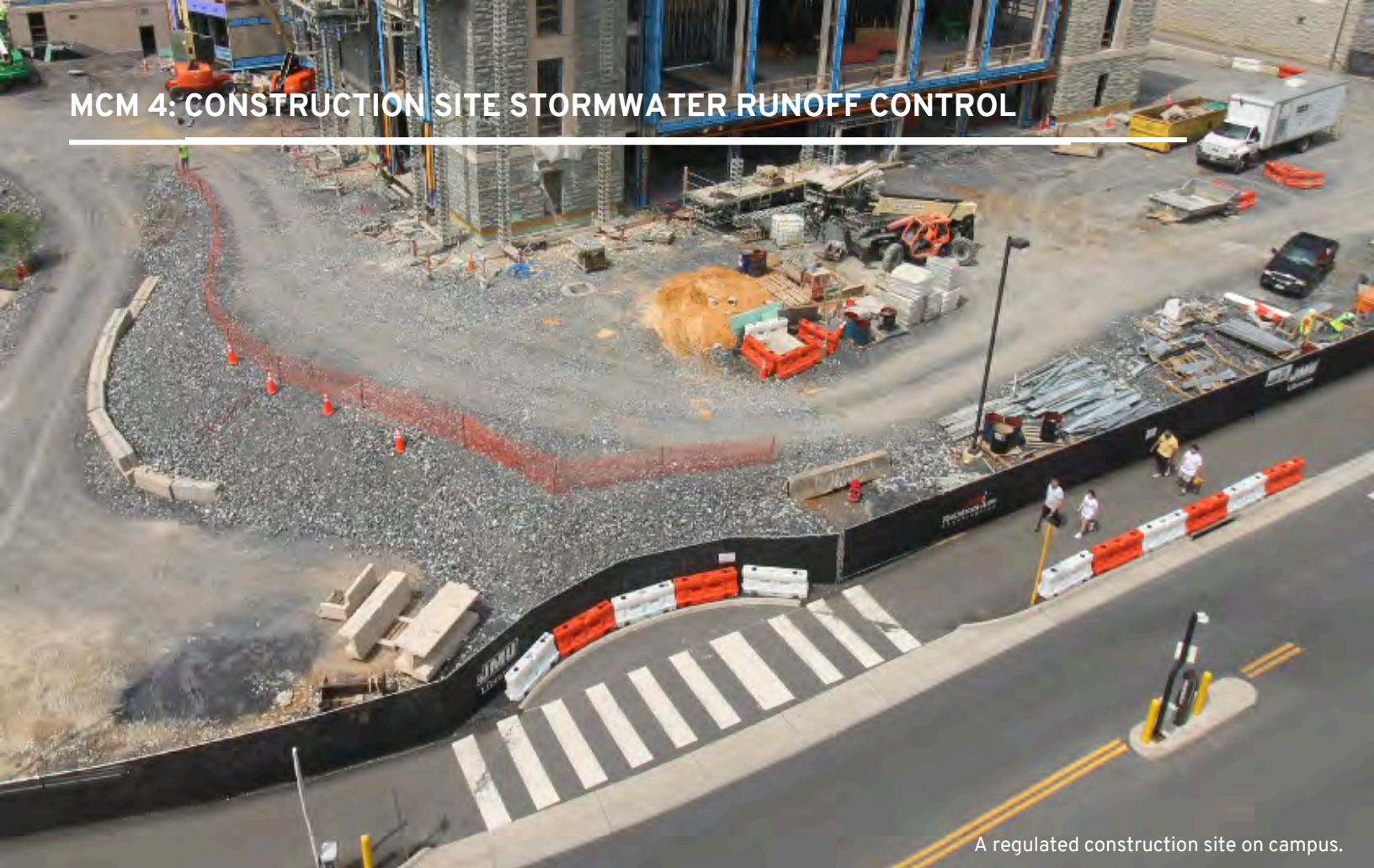
A regulated construction site on campus.