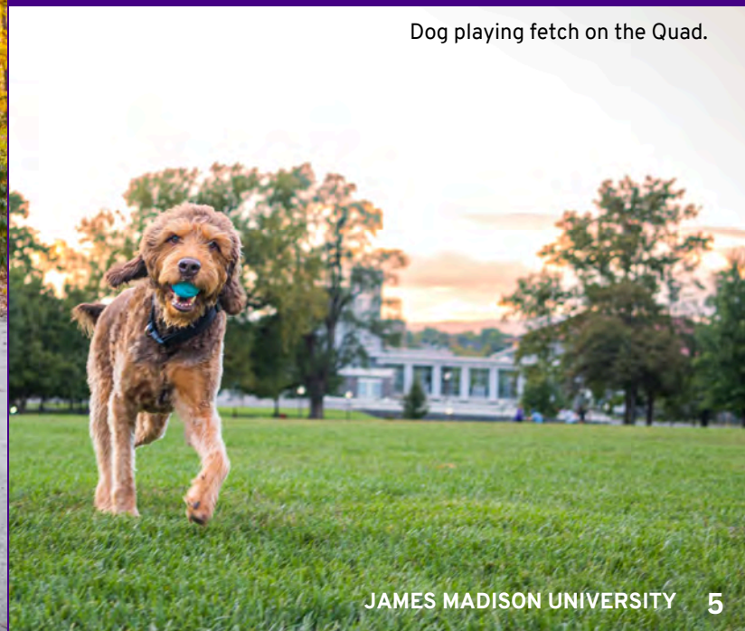
Dog playing fetch on the Quad.