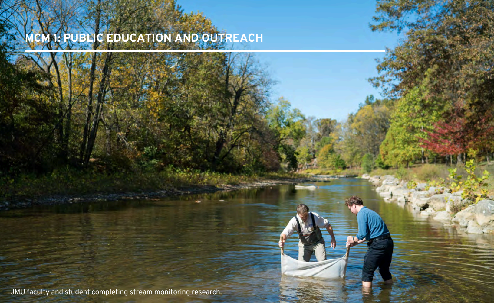
JMU faculty and student completing stream monitoring research.