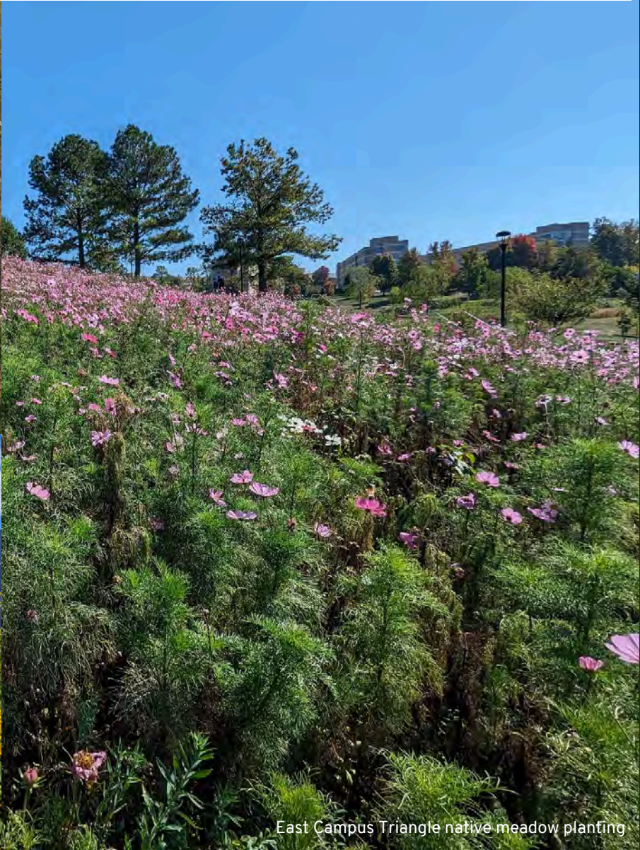
East Campus Triangle native meadow planting