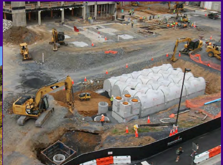
Underground detention facility installation.