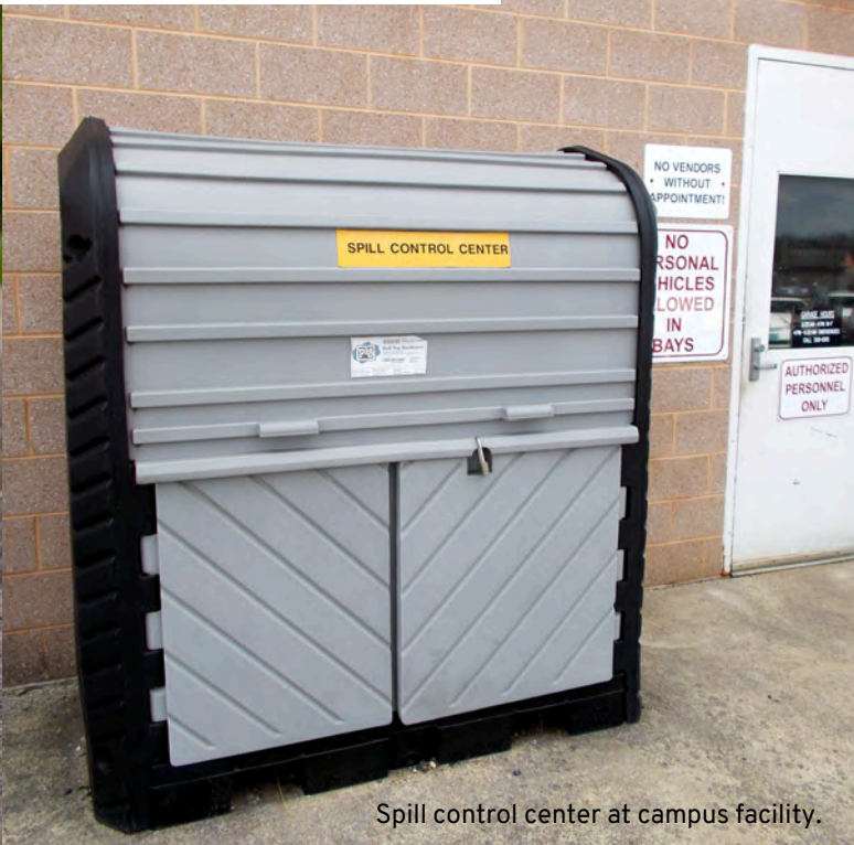
Spill control center at campus facility.