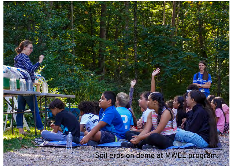
Soil erosion demo at MWEE program.

within the watershed and activities they can do at their own homes to reduce runoff and pollution. JMU Stormwater staff facilitated an activity where students took a hike through the arboretum and observed wildlife and sources and signs of pollution and made the connection between how pollution affects these organisms and ecosystems. Over 500 students and over 100 teachers and chaperones were able to participate in this MWEE program and with the hope they will turn learning into action.