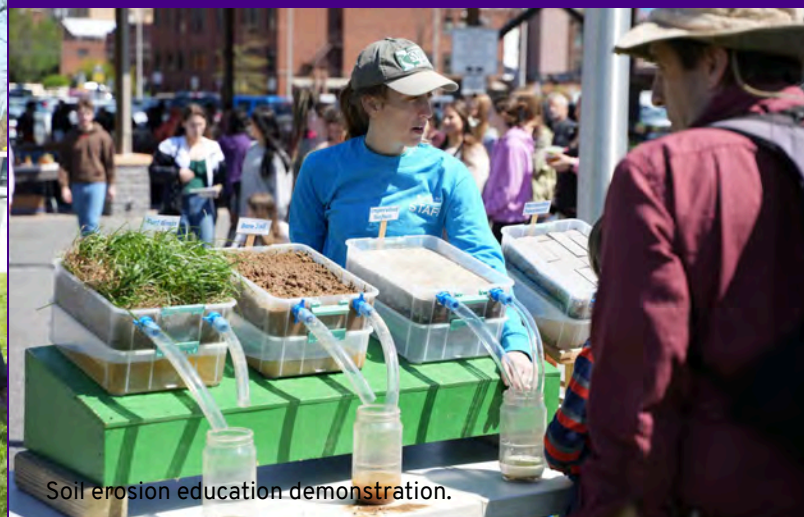
Soil erosion education demonstration.