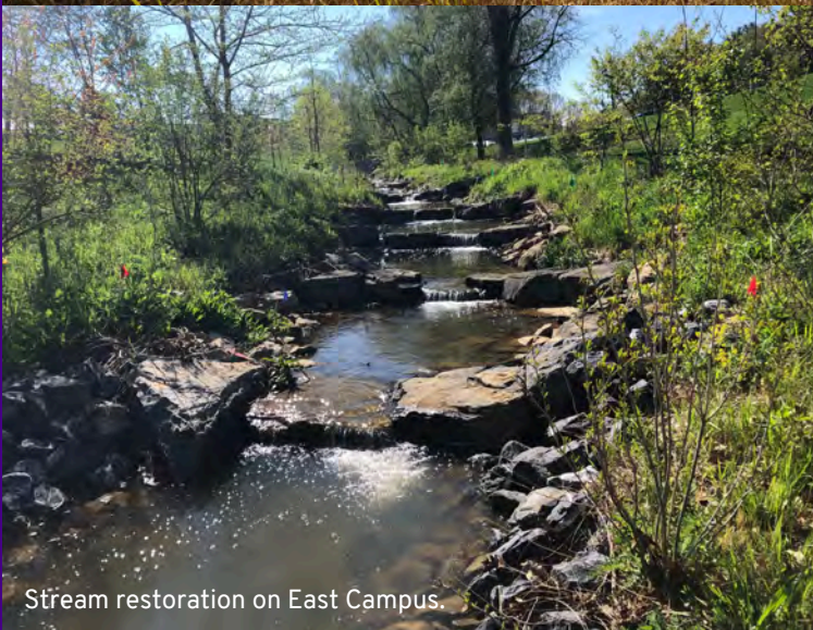
Stream restoration on East Campus.