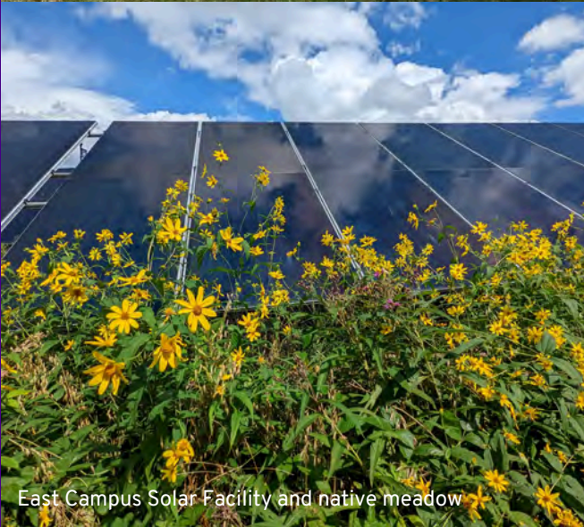
East Campus Solar Facility and native meadow