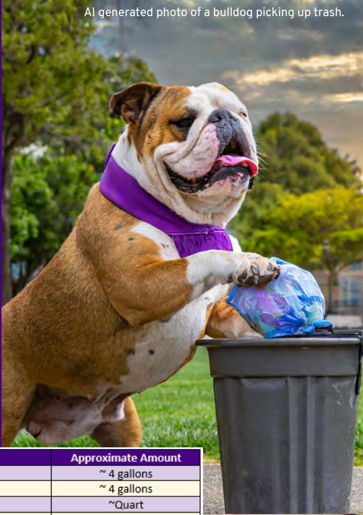
AI generated photo of a bulldog picking up trash.