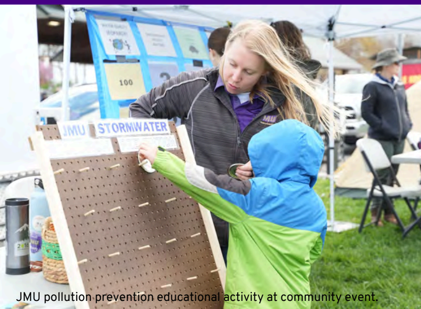
JMU pollution prevention educational activity at community event.

The combination of all activities implemented to provide educational outreach through a website, educational signage, speaking engagements, clean-up events, and involvement on committees allows for many beneficial activities for improving water quality.