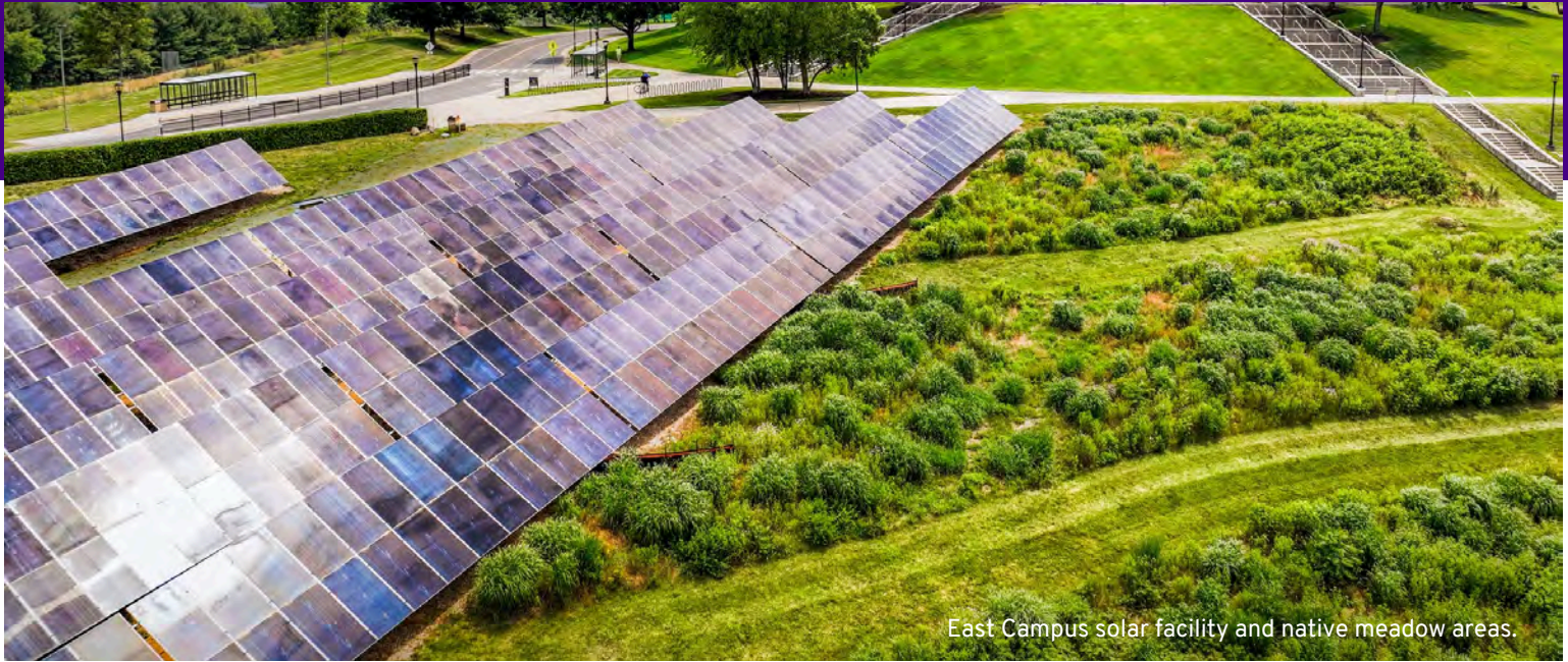
East Campus solar facility and native meadow areas.