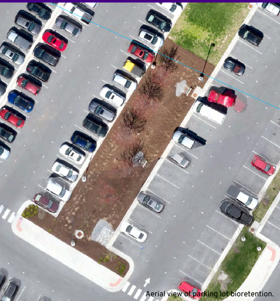
Aerial view of parking lot bioretention.

On Tuesday, June 18th, stormwater staff were notified by Sam Hottinger (GES) of a stockpile of erodible material on top of a storm drain at Sentara