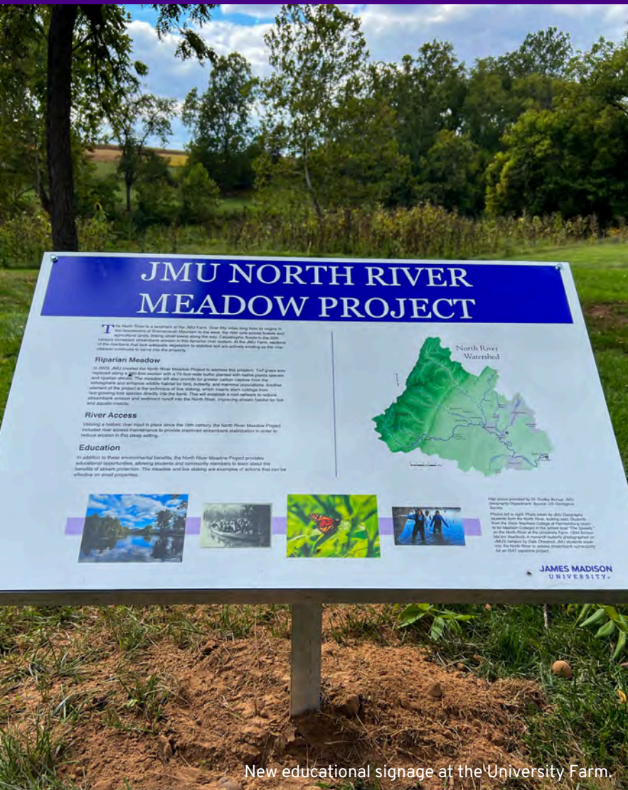
New educational signage at the University Farm.

There were no new storm drains installed in this program year, so no new storm drain markers were placed. Construction is ongoing for two large building projects, with the anticipation of installing several new storm drain markers on the stormwater inlets associated with those projects once they are completed.