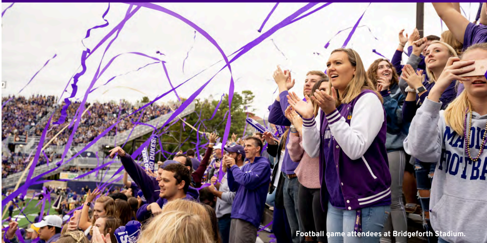
Football game attendees at Bridgeforth Stadium.

Faculty and staff are considered long-term members of the university community, and as such, will receive outreach on this topic cumulatively over the years. Students are short-term members of the campus community but will carry these lessons with them when they move on. Together these groups are the eyes and ears of the stormwater management team and play a critical role in addressing illicit discharges on campus. In general, bulletins or ads will be placed in the Breeze (printed student newspaper distributed throughout campus) along with posting on bulletin boards such as those at campus libraries during the first semester of each school year. Also, speaking engagements will be provided as requested to classes. (See Activity/Strategies for Outreach & Speaking Engagements table on page 8.)