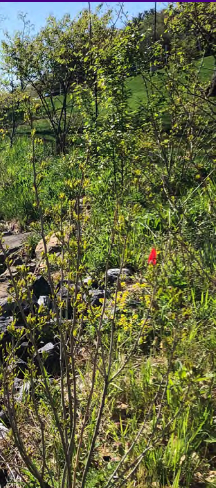
East Campus stream restoration and riparian buffer.