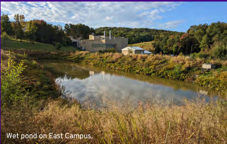
Wet pond on East Campus.

A total of 130 inspections were performed on JMU's 114 structural BMP's. All maintenance work completed on the structural BMP's were typical maintenance items. Approximately $42,026.45 was expended for inspections, maintenance, and repairs of stormwater management facilities.