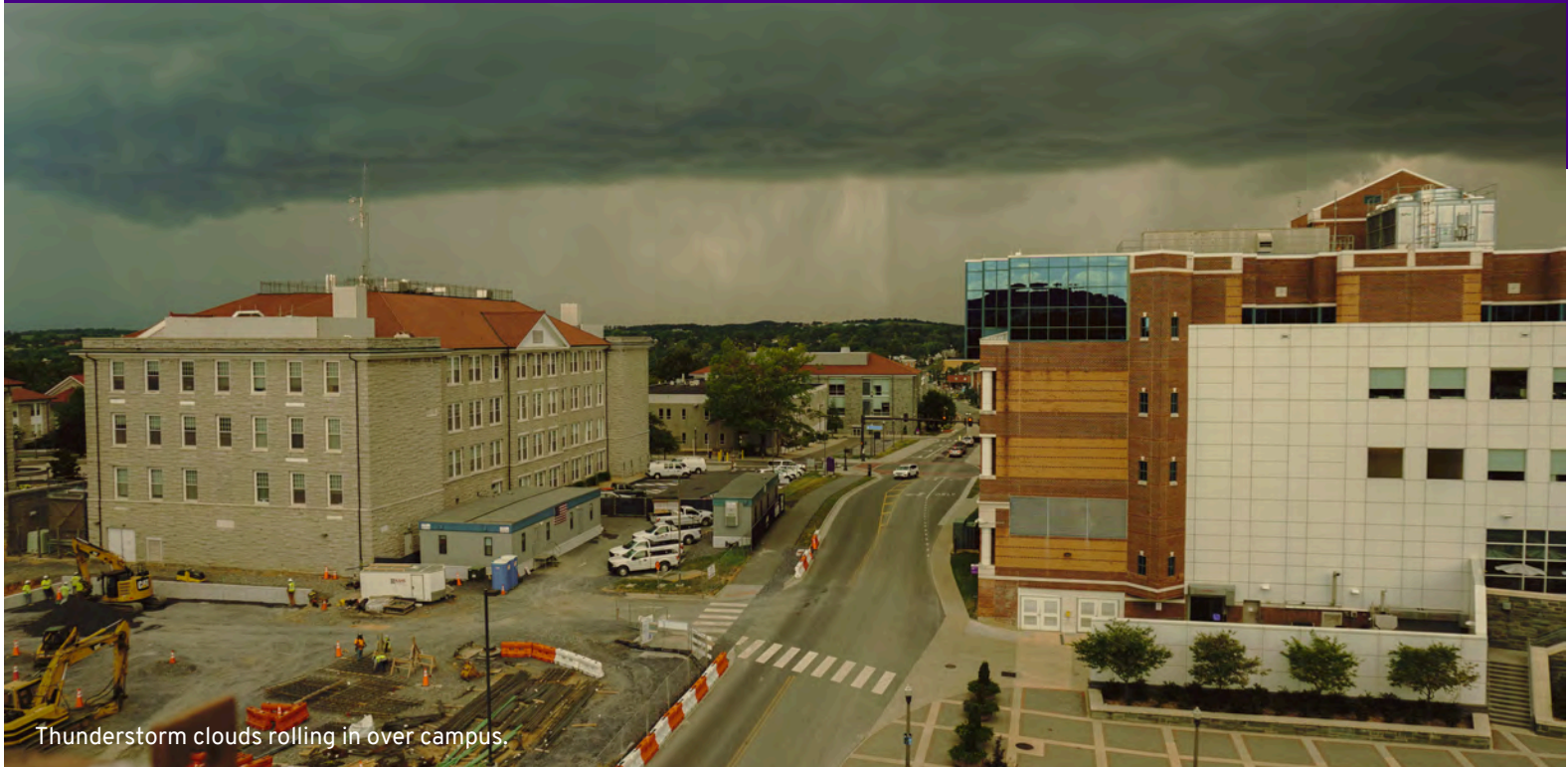
Thunderstorm clouds rolling in over campus.

To best identify the most efficient use of resources to distribute information related to stormwater impacts to the public, three main issues have been identified for focus: public awareness of pollution prevention and reporting of water quality issues, litter prevention at outdoor athletic events, and bacteria from animal wastes and sanitary sewer overflows. These three issues have been selected as they target audiences that are most likely to have significant impacts on stormwater quality within the University.