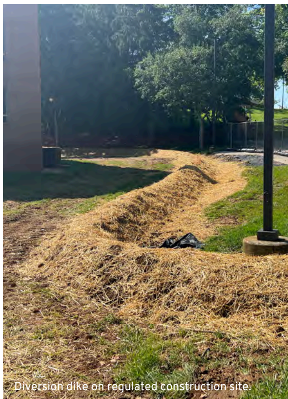
Diversion dike on regulated construction site.