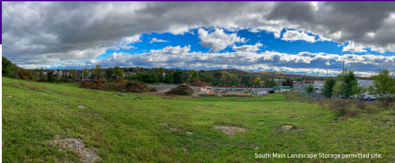
South Main Landscape Storage permitted site.