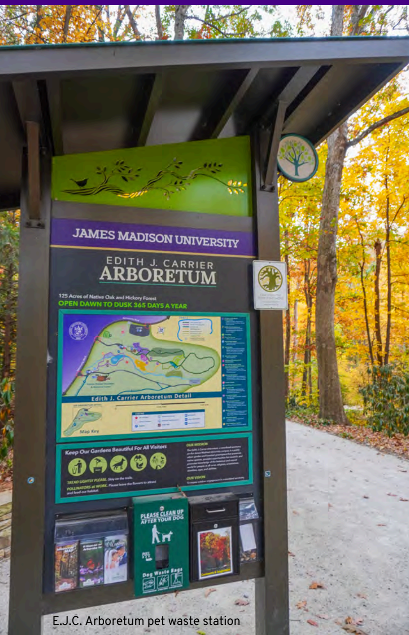
E.J.C. Arboretum pet waste station

JMU continues to focus on the education of pet owners through signage and access to pet waste stations. The year-round signage will serve as a reminder to pick up after pets.