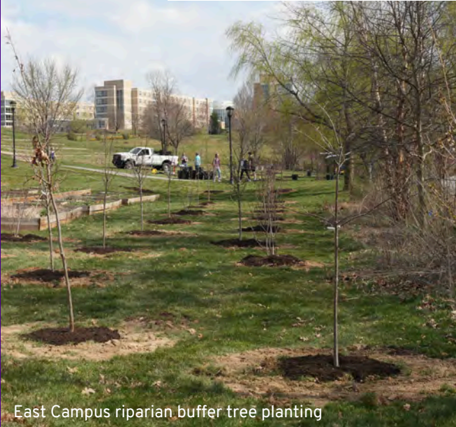
East Campus riparian buffer tree planting