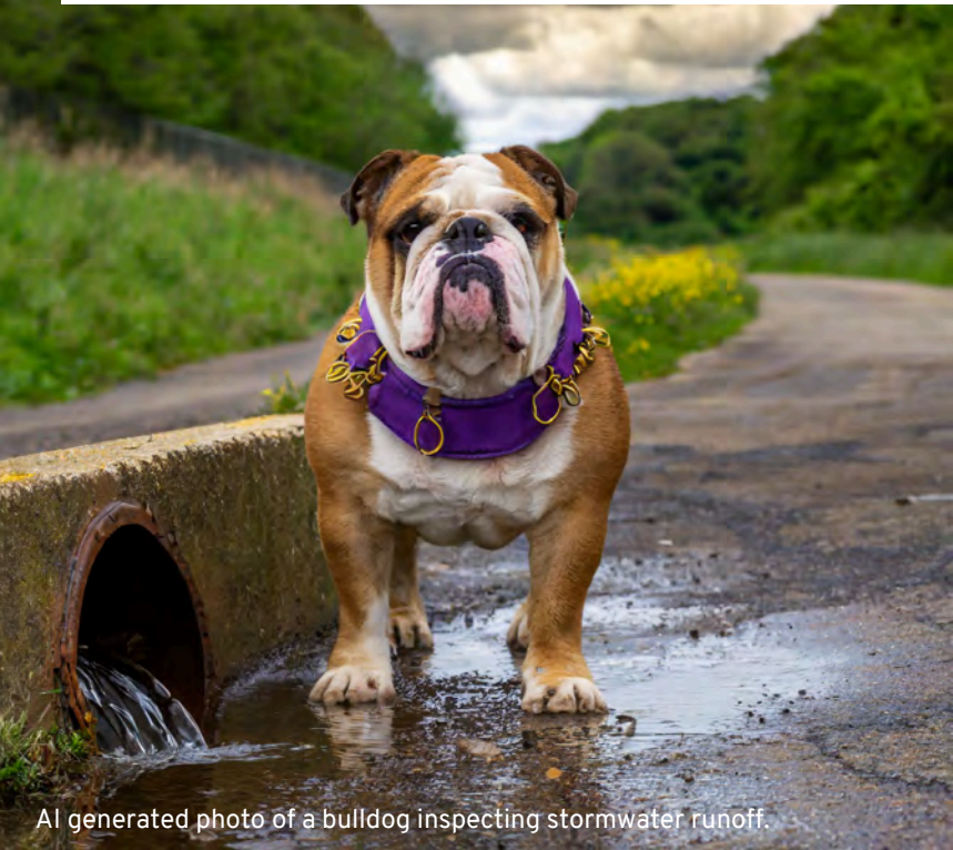
AI generated photo of a bulldog inspecting stormwater runoff.