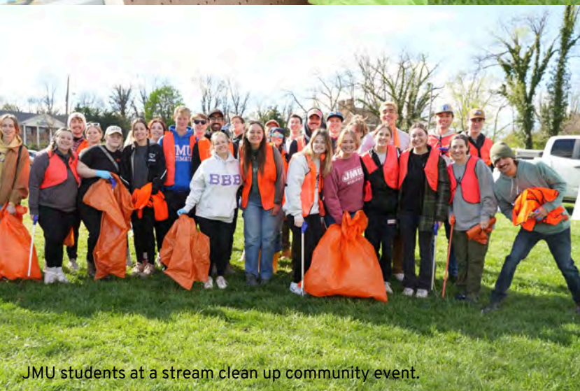
JMU students at a stream clean up community event.