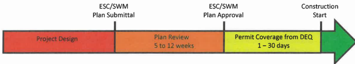
Figure 1. Typical time frame for plan review approval, submittal of registration statement, and receipt of permit coverage.

Once the plan and supporting documentation is deemed to be adequate, a plan approval letter will be forwarded to the project engineer. If the project will require a state construction general permit coverage, a SWPPP will need to be developed and a construction general permit registration statement submitted to the DEQ.