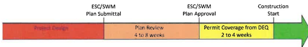
Figure 1. Typical time frame for plan review approval and receipt of permit coverage.

Once the plan and supporting documentation is deemed to be adequate, a plan approval letter will be forwarded to the project engineer. If the project will require a state construction general permit coverage, a SWPPP will need to be developed and a construction general permit registration statement submitted to the DEQ.