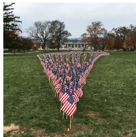
The Flag Display on the Quad, honoring fallen soldiers for Veteran's Day