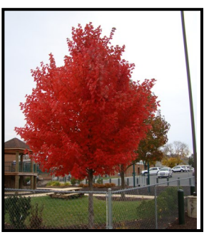
Tree in play area next to Anthony Seeger