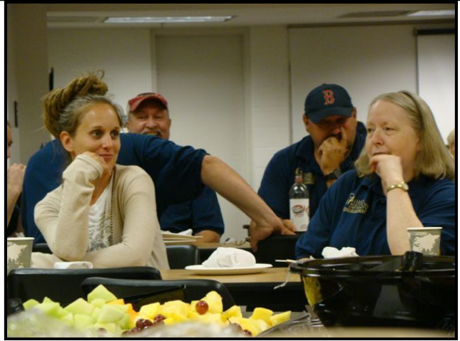
Housekeepers at FM summer picnic for night shift