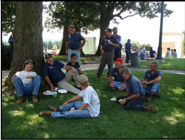
Landscape crew at FM summer picnic