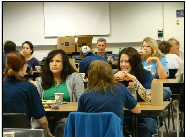
Housekeepers at FM picnic for night shift