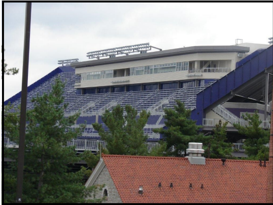
Bridgeforth Stadium Expansion