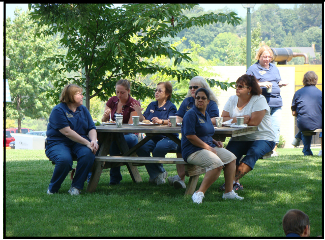
Housekeepers enjoying the FM summer picnic