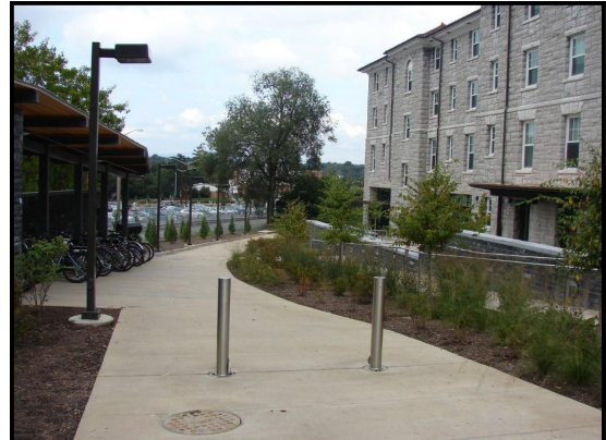
Back of Wayland Hall