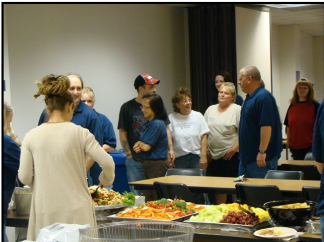
Housekeepers at FM picnic for night shift