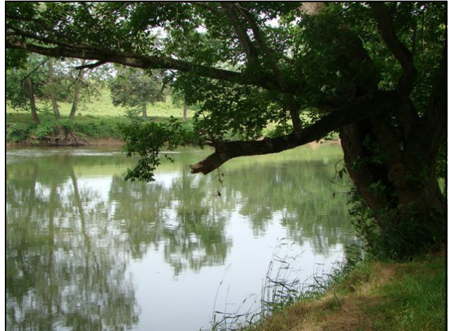
View from the farm on to the North River

Although the farmhouse is currently boarded up, the grounds are still used by students, faculty, staff, and the community. In addition to the house, the property has pits for barbeque and horseshoes, a pavilion with many picnic tables, and restrooms. Many years ago, Facilities Management held their summer picnics there. FM keeps up the property by mowing, cleaning the restrooms and handling any other maintenance that is required. Anyone interested in renting the facilities can contact JMU's Event Management at 568-6330.