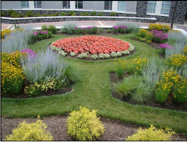
Flower bed behind Performing Arts Center