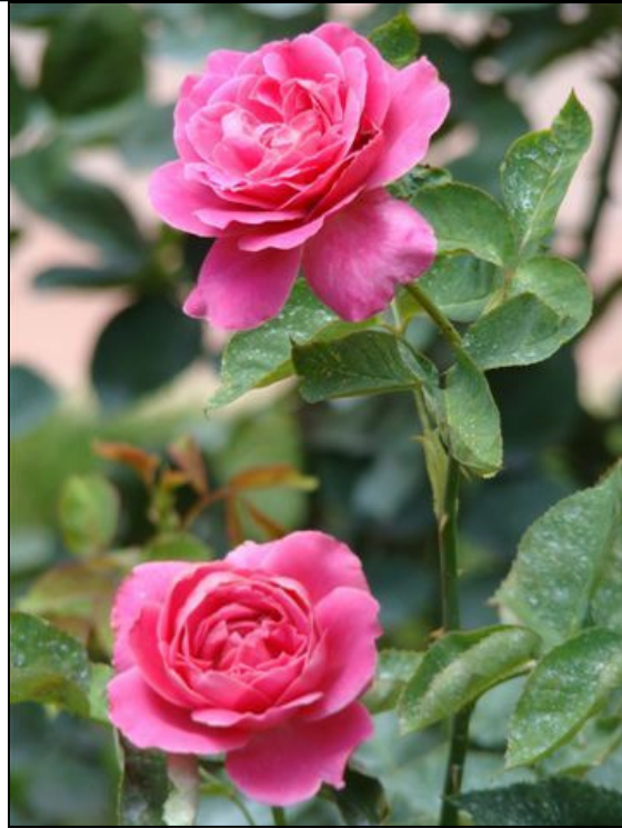
Roses from garden behind Wilson Hall