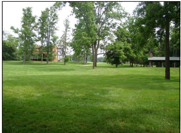
View of the farmhouse (left) and the pavilion (right)