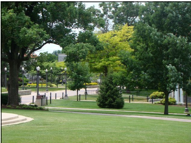
Campus between Maury and Jackson Halls