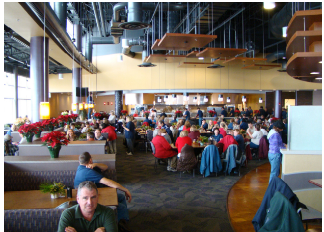
FM employees at the East Campus Dining Hall