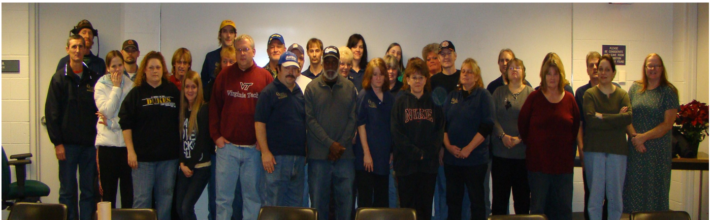
Night shift workers