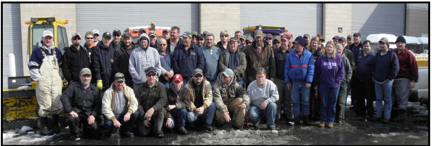
Facilities Management employees who participated in snow and ice removal