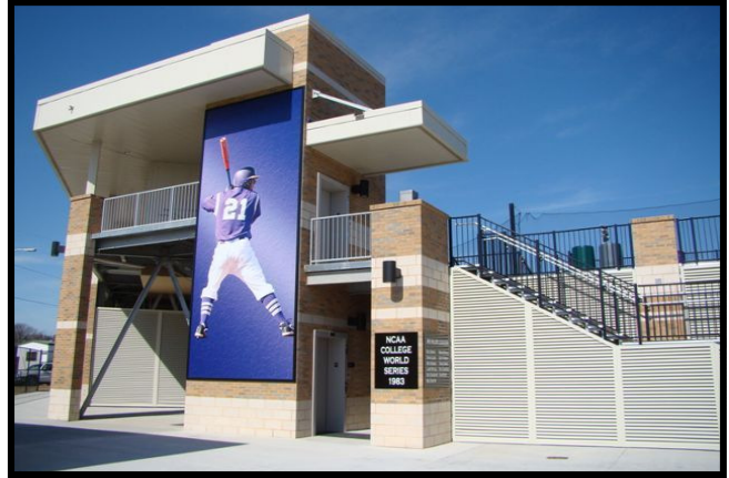
Softball/Baseball Complex at Memorial Hall