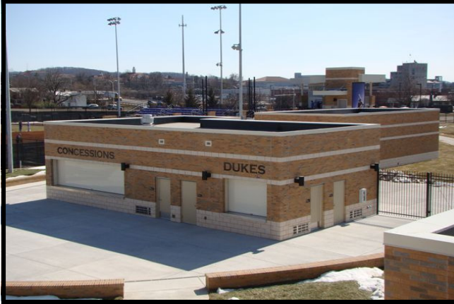
Concessions building at Softball/Baseball Complex at Memorial Hall