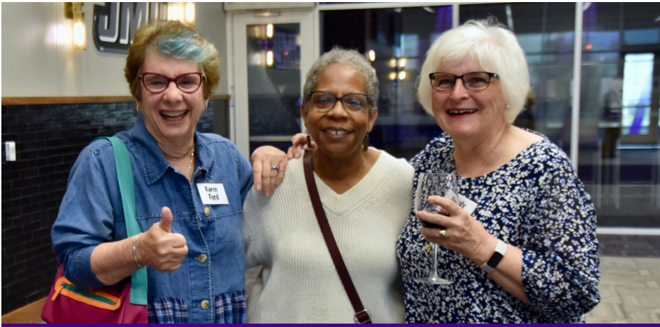
Faculty Emeriti Association Members enjoying lunch and each other!