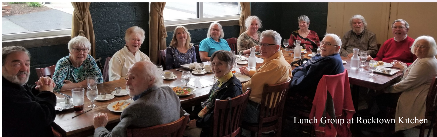
Lunch Group at Rocktown Kitchen