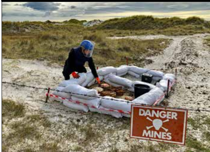
Clearance on the Falkland Islands.

The Journal invites government/nongovernment organizations, field/research practitioners, policy advisors, and technical experts working in humanitarian mine action/conventional weapons destruction to contribute their challenges, experiences, and lessons learned in the form of practice-based article submissions.