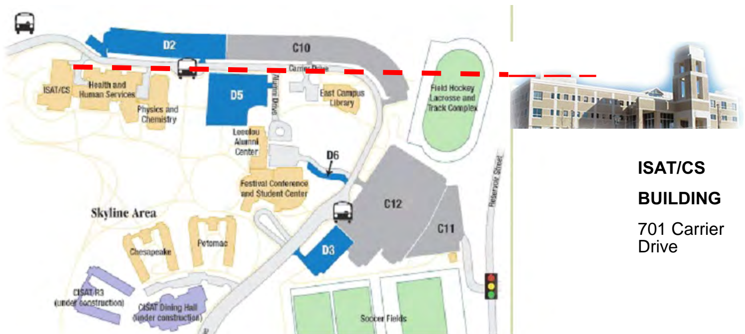
ISAT/CS BUILDING 701 Carrier Drive