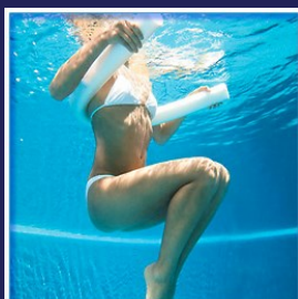
Noodle Tucks, Knee to Chest