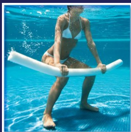
Noodle Push/Pull with Squat