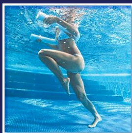
High Knee Running