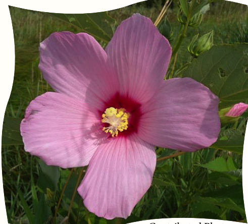
Contributed Photo, Mallow

Swamp rose mallow - Hibiscus moscheutos - is a perennial that is one of the largest and showiest of all native flowers. Growing from 3-8' tall in partial to full sun, in wet to moist conditions, it survives in many different soil types. Mallow flowers are large, white or pink, and sometimes grow 8" wide. These showy saucer-size flowers open during late summer through fall