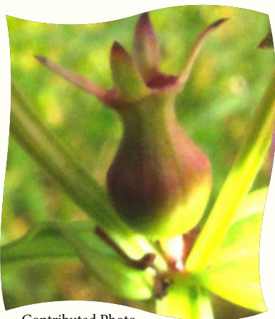
Meadow Beauty

The last stage of the Arboretum stream restoration project this fall will include planting hundreds of perennial wildflower “plugs” (tiny rooted starts) and small trees along the stream banks and buffer areas known as the riparian area or floodplain. Additional adjacent wetland plantings will conclude this project. Many of the riparian plants being planted, such as cardinal flower and ironweed, can be found growing in upland areas as well as riparian and wetland areas. Some new additions to the Arboretum gardens include pickerel weed, Virginia meadow-beauty, and swamp mallow.