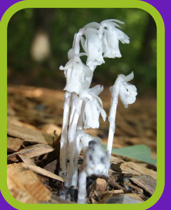
Indian Pipe— Monotropa uniflora

This common shade loving native is also known as Ear-drop, Touch-Me-Not and Silverleaf. Used today as a poison-ivy rash inhibitor and anti-itch remedy, an American naturalist named it the Hummingbird Tree because its nectar and brilliant orange flowers are so attractive to hummingbirds. Early Americans used it as a cure for jaundice and bruises, cuts, insect bites and burns.