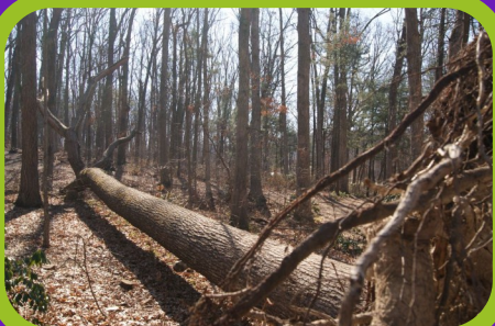
Image of the fallen black oak that was uprooted last summer

The committee members have combined their expertise and consulted with a landscape architect several times regarding plans for garden areas near the pond. A new planting plan has been created for this area.