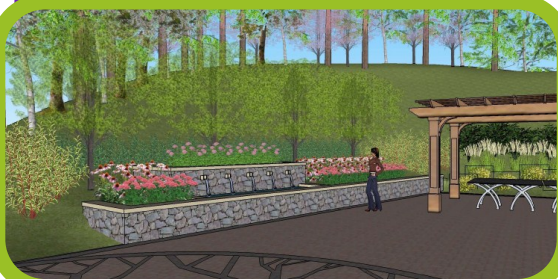
Preview of the Dr. Ronald E. Carrier 80th Birthday commemorative water feature

Committee members are making plans for a proposed new Monarch Waystation near the Plecker Pond Loop Accessible Trail and creating an inventory of butterfly food and nursery plants for the garden. The butterfly garden will include both upland and wetland nectar plants that will provide habitat and will accent the wet areas near the bald cypress tree by the main pond.