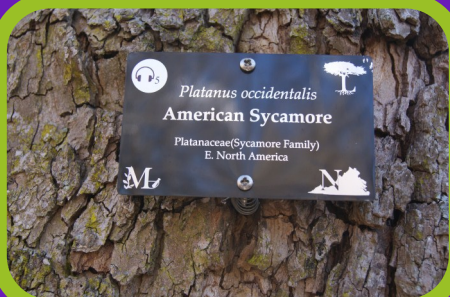
Example of an identification label