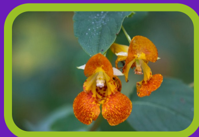
Jewelweed— Impatiens capensis