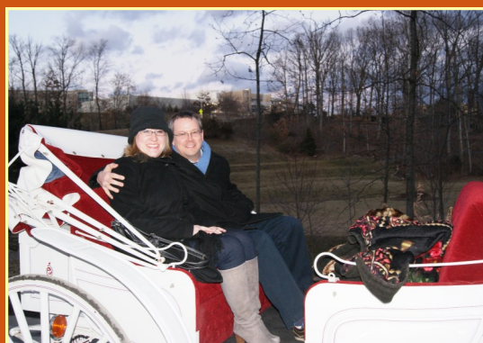
Families and couples are among those who enjoy carriage rides at the EJC Arboretum