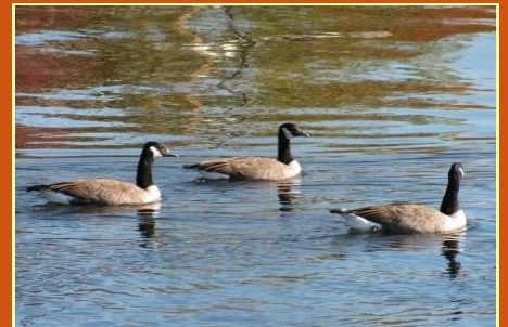
Contributed photo (above)

The EJC Arboretum was voted the " Best Place to Relax " and " Best Place to Propose " in the annual reader survey by the Harrisonburg Daily News-Record.