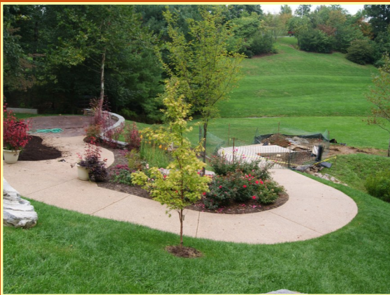
Stage Garden