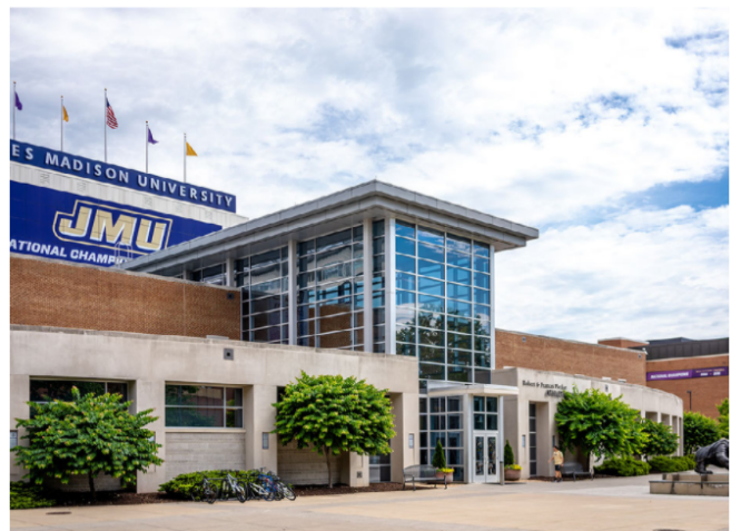
Left to Right: Student Success Center, Bioscience, University Recreation Center, and Plecker Athletic Performance Center