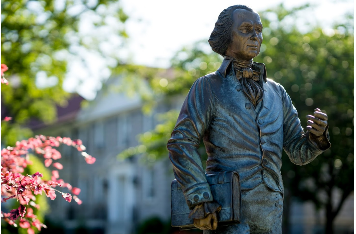
A life-size statue of James Madison himself stands on the end of the Quad.