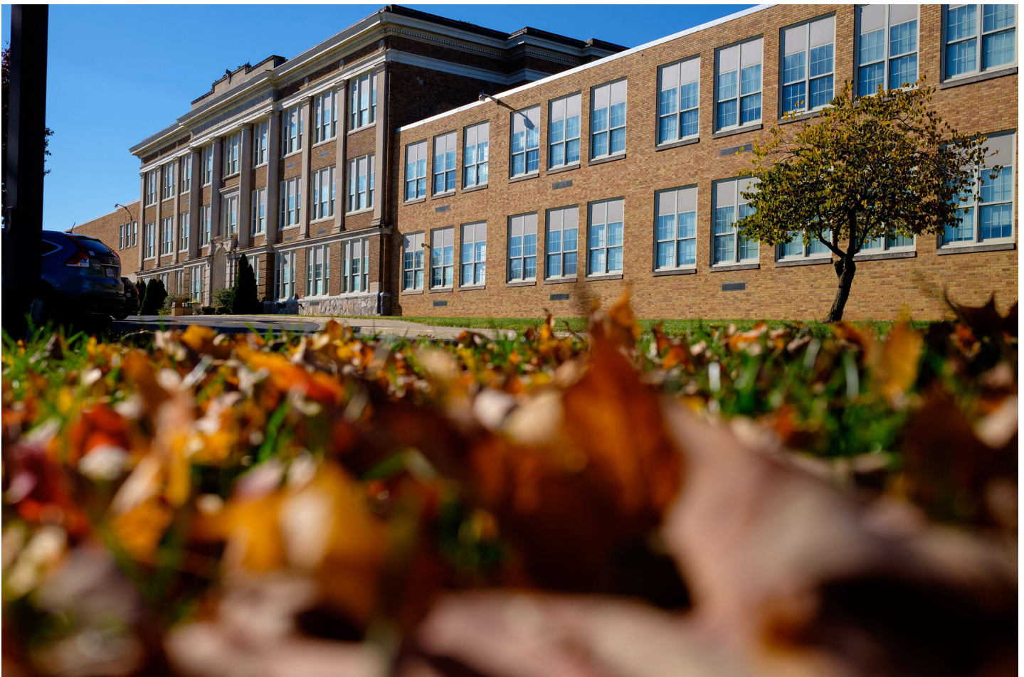
Memorial Hall, James Madison University