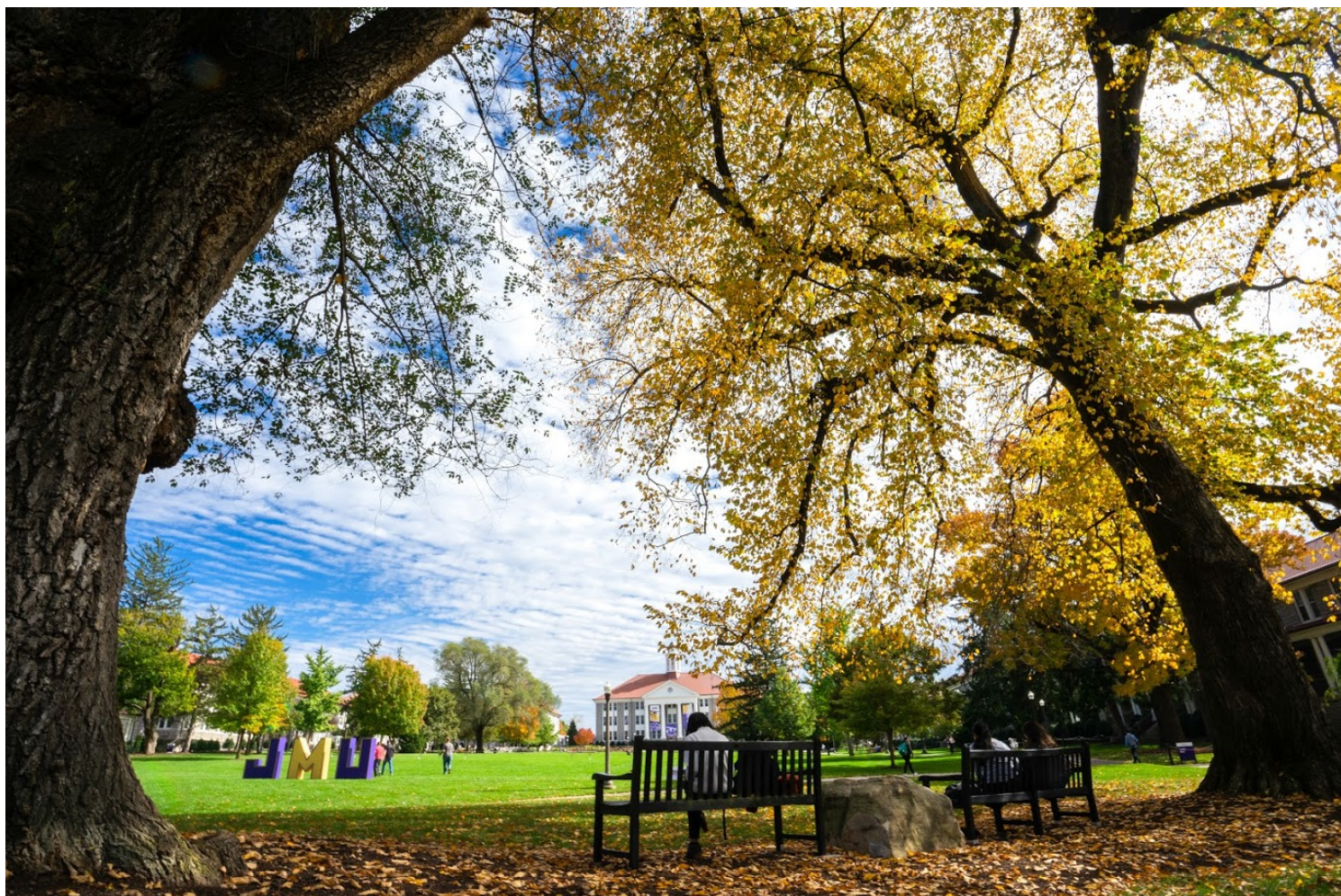
In a normal fall, students would be gathering on the quad.

We invite you and your students to follow us on Instagram @JMUadmissions , too. If you have not already, please consider joining our counselor mailing list to stay up to date on all things JMU!