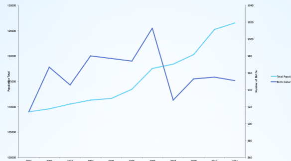
Figure 1. 2001-2011 Rockingham County population and birth cohort from 2001 to 2011.

As the population of the county increased, the number of births taking place decreased.