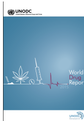
UN report on Global Narcotics