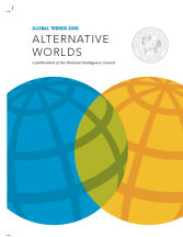
National Intelligence Council's Global Trends 2030: