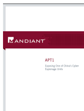
Mandiant report on Chinese Cyber