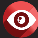
Conjunctivitis (Red eyes)