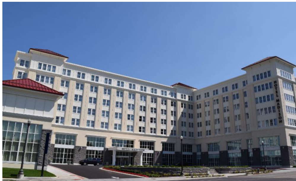
Hotel Madison & Shenandoah Valley Conference Center